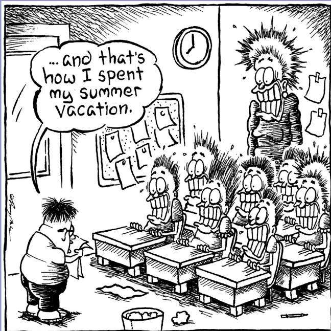
Young Stephen King